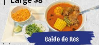
Caldo de Res

Mexican soup made with hominy and pork. $17.95