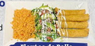
Flautas de Pollo

Four rolled fried corn tortillas filled with shredded chicken, served with rice, lettuce, pico, avocado, queso fresco, and crema mexicana $15.50