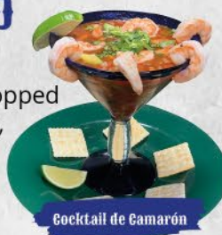
Cocktail de Camarón

Raw shrimp mixed with lime juice and serrano peppers, red onions, jalapeños and cucumber $17.50