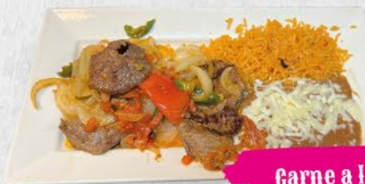
Carne a la Mexicana

Grilled sliced steak cooked with tomatoes, onions, and jalapeños, served with rice, beans, and tortillas $17.95